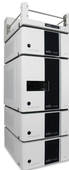
Figure 1. SCION Instruments LC 6000

Figure 1 shows the SCION Instruments LC 6000 with UV detector on which this method is applicable to.